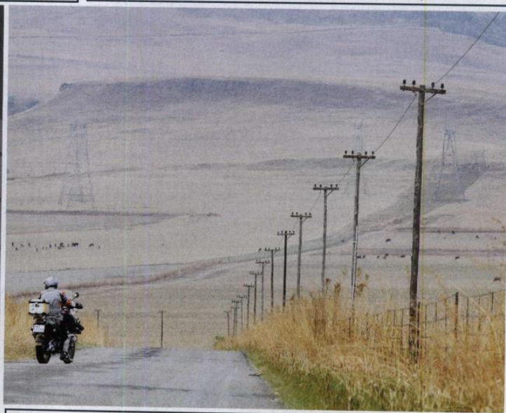
A scenic photo on one of the routes.