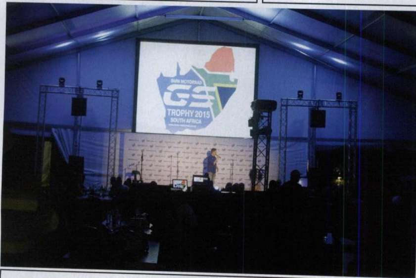
The Saturday awards Ceremony